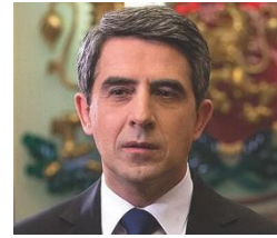
Mr. Rosen Plevneliev

President of the Republic of Bulgaria, 2012-2017. Mr. Plevneliev will bring his wealth of experience and expertise, sharing invaluable insights into the complex interplay of global economic trends and geopolitical dynamics. He will focus on the challenges and opportunities in the modern era that will shape business and investment decisions across the CEE region and beyond.