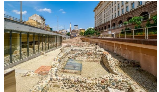
Sofia's Roman past