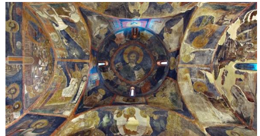
Boyana Church – UNESCO World Heritage site