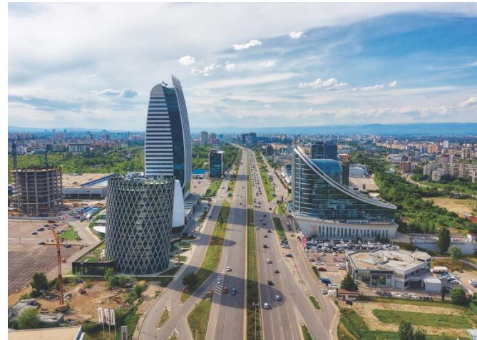
Sofia - Business District